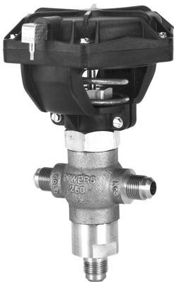
658 Powertop Sequence Valve.

Designed to select and modulate the flow of either hot or chilled water, without mixing, for radiant panel and similar applications, the 658 Powertop Sequence and Changeover Valves are designed with 2 inlets and one outlet for the sequence valve and with one inlet and 2 outlets in the changeover valve.